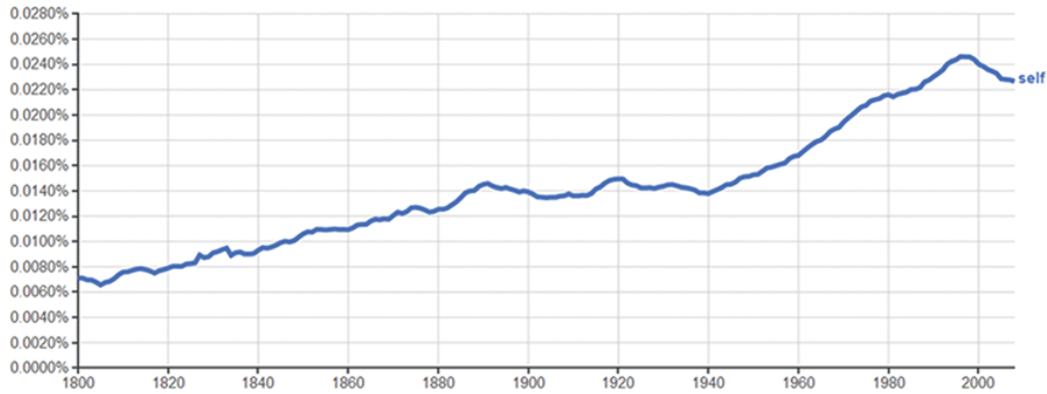
Figure 1. The proportional occurrence of the word self in a corpus of books published in English between 1800 and the present.