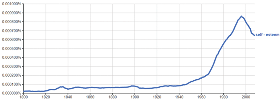
Figure 3. The proportional occurrence of the word self-esteem in a corpus of books published between 1800 and the present.